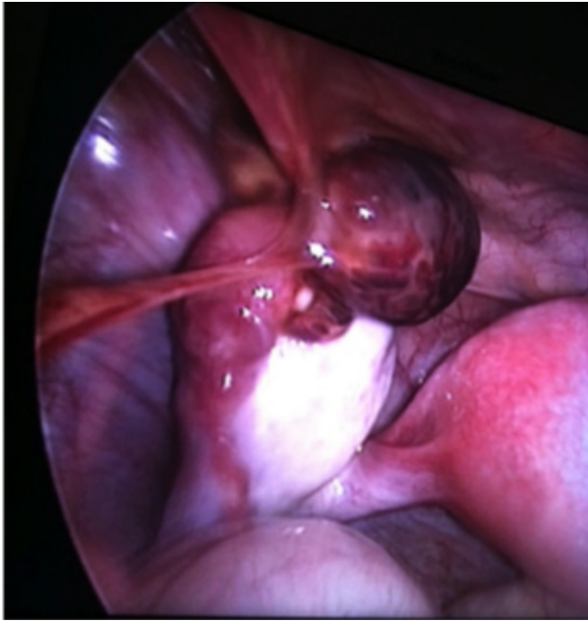
Figure 2: The laparoscopic view of left ovarian pregnancy. The tube is intact and the mass is adjacent to the ovary.