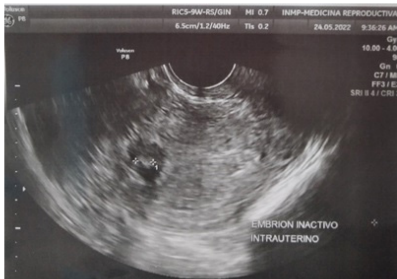
Figure 2: Intrauterine pregnancy with inactive embryo.