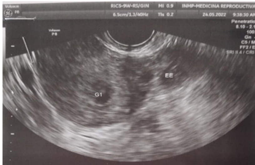
Figure 1: Ultrasound image of heterotopic pregnancy (G1: intrauterine pregnancy, EE: ectopic pregnancy).

The patient evolved favorably, her control hemoglobin was 12.2gr/dl. So she was discharged the next day.