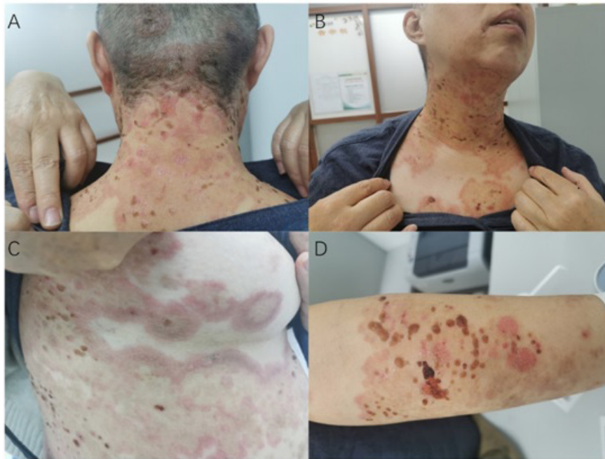
Figure 1. The patient's skin developed multiple ring-shaped erythema, scattered in blisters, accompanied by erosion and scab on the neck (A-B), head, torso (C), upper limbs (D).

agnosis was epidermal hyperplasia; focal sub-epidermal pustule formation; interface inflammation; spongy edema; lymphocyte infiltration; and a small number of plasma cells, consistent with drug-induced dermatitis (Figure 2). Immunofluorescence and other tests showed negativity for ANTI-desmoglein 1, ANTI-desmoglein 3, and BP180; positivity for DIF: linear IgG and C3; and negativity for both IgM and IgA and IIF: IgG, IgM, IgA, and C3, confirming the diagnosis of bullous pemphigoid (BP). The patient was started on 80 mg oral prednisone and 100 mg oral minocycline daily. After 3 days of therapy, the dose of oral minocycline was increased to 200 mg/day as new blisters continued to appear. The patient was also started on oral niacinamide 900 mg/day and oral niacinamide 500 mg/day as adjunctive therapies. No new blisters developed after 1 week of treatment, and thus, the medication was gradually discontinued. BP did not recur thereafter. The patient was followed up every 3 months, and the most recent MRI did not reveal significant progress in the mass.