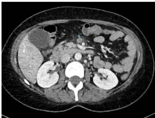
Figure 1: showing Mesenteric Vein thrombosis ( marked with arrow)

of infarcted bowel. A follow up CT angiogram the next day confirmed the diagnosis of SMVT. Prior to discharge she was started on warfarin and has been doing well with regular follow up in anticoagulation clinic.