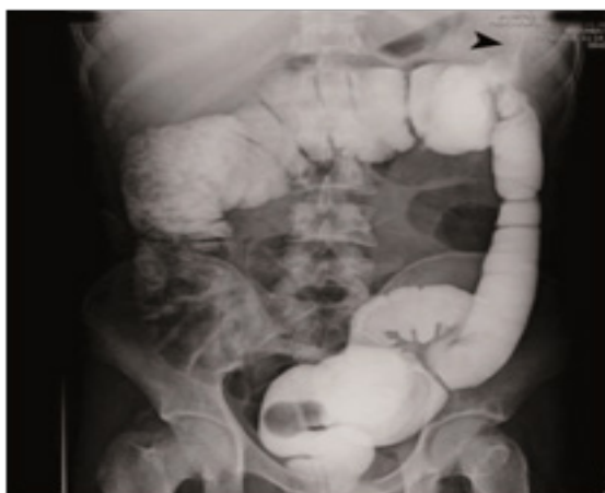
Figure 2: Contrast barium enema showing communication between colon and pleural cavity (black arrow).