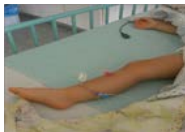
Figure 1: Intraosseous access outside of recommended site

Access was gained at first attempt at the right tibia (Fig 1). Hemodynamics could be stabilized (sinus rhythm 120/min, blood pressure 90/50 mmHg) after 1 l of crystalloids (given in a 20/20/20cc/kg manner) and under norepinephrine 0.2 \mu\text{g}/\text{kg}/\text{min} (forced by syringe driver to the bone). While oxygen saturation increased to 91% under oxygen insufflations the patient regained consciousness and opened his eyes to verbal stimulation. The team discussed the situation and the possible options.