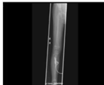
Figure 2: Contrast-enhanced X-ray of right leg:vascular spread