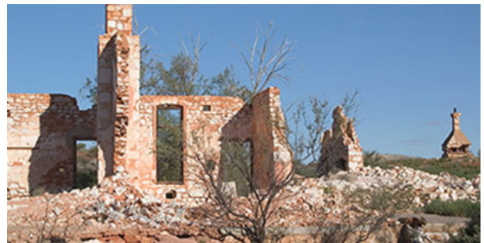
Figure 2: Ruins of Big Bell Hospital today

A Mr James Cunningham wrote to the local paper suggesting that one large financially viable well-staffed hospital in Cue, only eighteen miles distant via the ambulance service, rather than two small hospitals with inadequate funds and limited staff and facilities. None the less the Hospital Committee continued optimistically with plans for a New Year's Eve Carnival and Casino Night to continue fund raising [55-60].