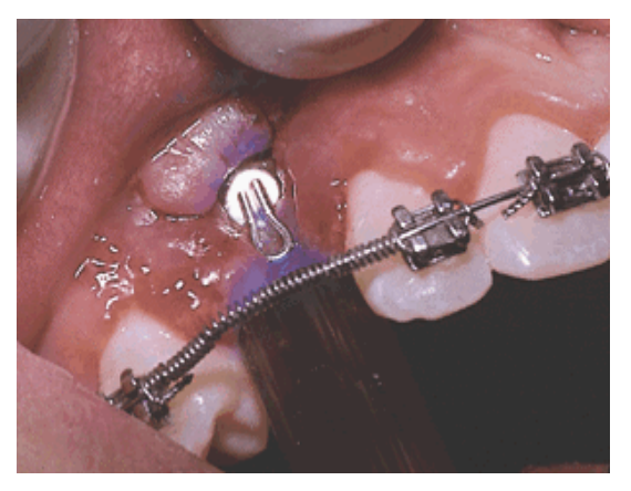
Figure 6: Tunnel Technique.

The extraction of the deciduous tooth provided a natural osseous tunnel, which was easily extended by drilling, to reach the cusp of the impacted tooth ( Figure 6 ).