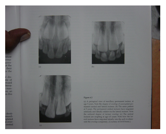
Figure 7: Central Incisor impaction.

13.1.2. Incisor Impaction: An impacted maxillary central incisor is more conspicuous to parents. Typically, this occurs when the child is between 8 and 10 years of age ( Figure 7 ).