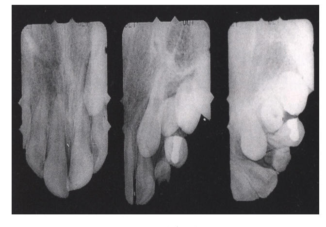
Figure 2: Cone shift technique.

a. Tube-shift technique or Clark's rule. Two periapical films are taken of the same area, with the horizontal angulation of the cone changed when the second film is taken ( Figure 2 ).